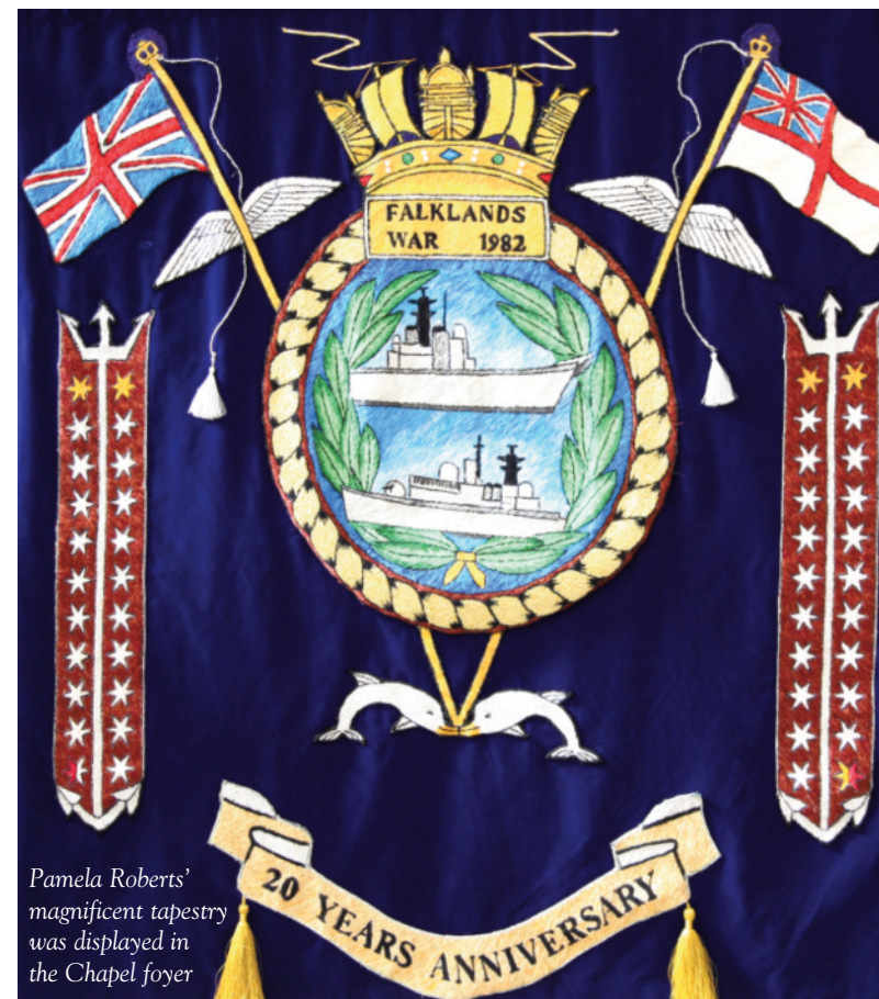
Pamela Roberts' magnificent tapestry was displayed in the Chapel foyer