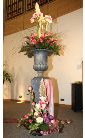
Sir Rex Hunt's Hat! In all it's glory.