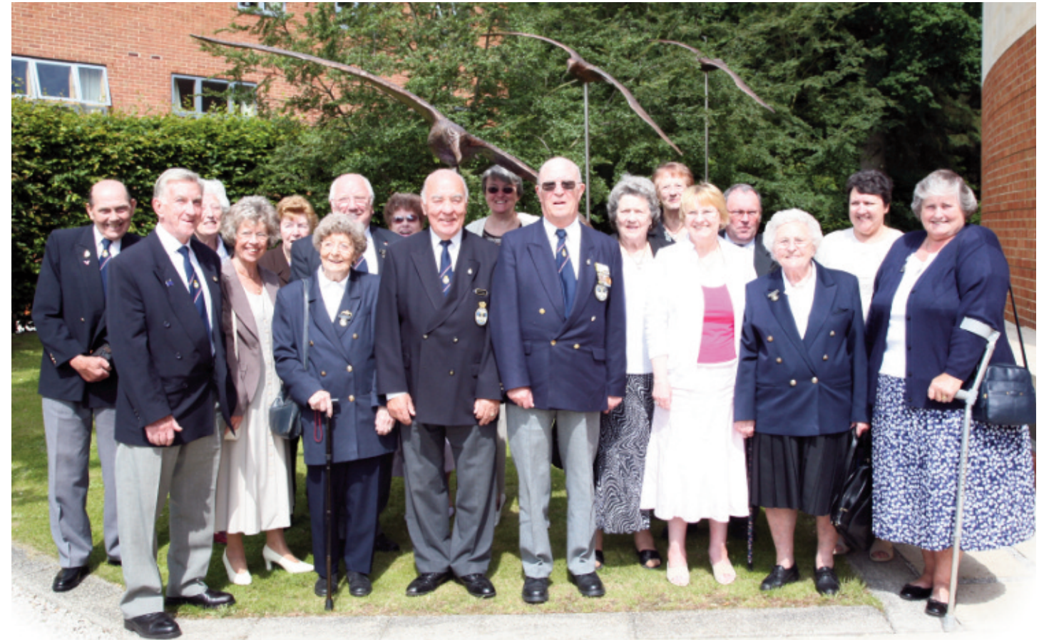
Loyal supporters from HMS Aldenham have been to every Annual Service in their numbers