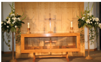
The Naked Altar - unusually without altar cloths