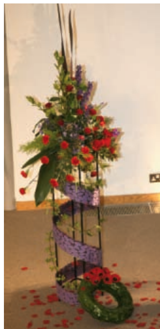
We Remember Them... The memorial display.