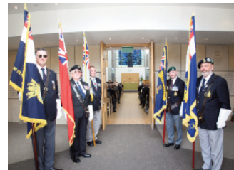
The faithful Standard Bearers come every year & are much appreciated