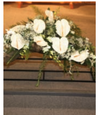
The Great White Whale - a floral display of distinction.