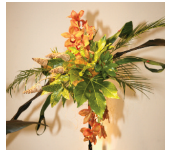
One of three - albatrosses - so symbolic of the chapel.