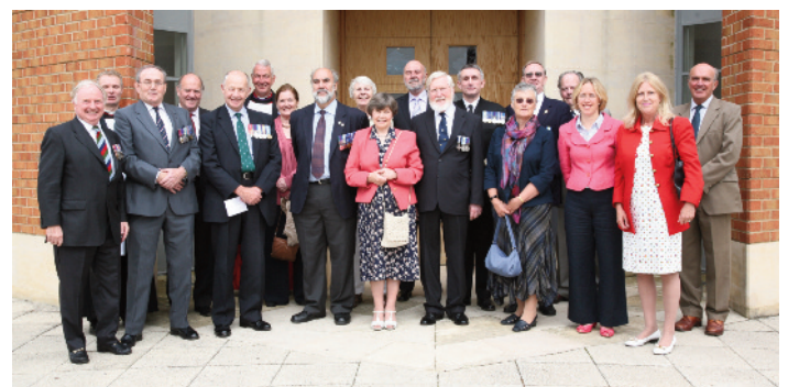
RFA veterans & Chapel Trust representatives celebrate the presentation of the RFA Sir Galahad Ship's Bell to its final resting place within the Memorial Chapel