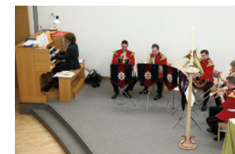
The Band of the Coldstream Guards