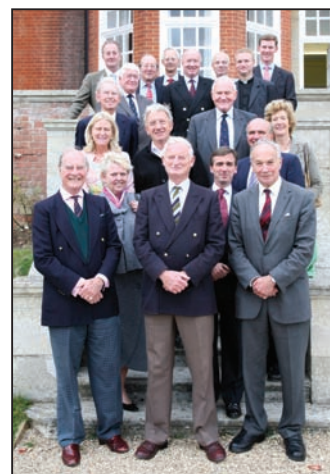
Trustees gather on the steps outside Devitt House in 2008