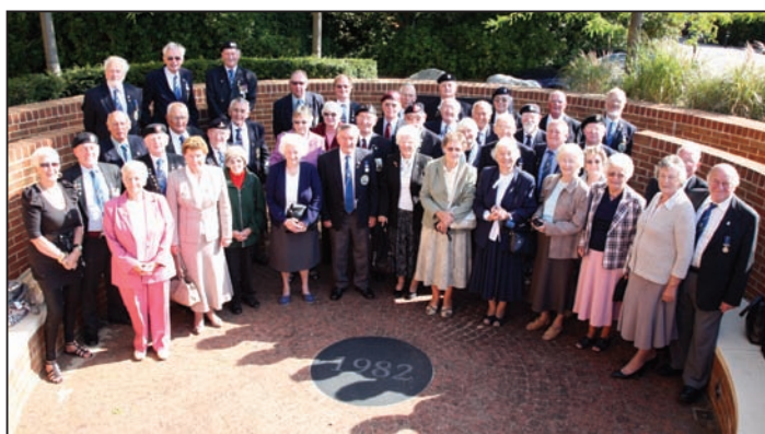
Suez Veterans and their wives in the memorial garden.