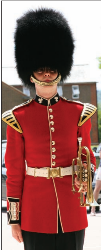
Bugler of the Irish Guards Brass Quintet