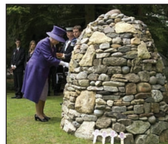
Her Majesty The Queen places her stone in the Cairn for the 25th Anniversary

are perished as though they had never been". That is not the case here. Regular use of the Chapel by thousands of visitors, especially the Pangbourne community on a daily basis, ensures that the legacy of the 258 names inspires and dignifies the lives of our extended family. Here in the heart of the Berkshire countryside their names really do live on. This suggests that the Trustees' concept of a living memorial has indeed come to pass.