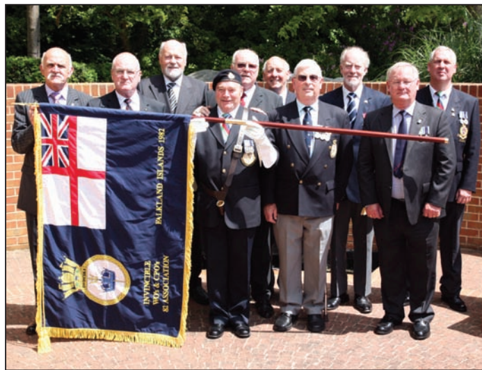
Members of HMS Invincible with their newly dedicated Standard at the Annual Service on Sunday June 14th 2009

In further celebration of the 10th Anniversary this year's Service – on Sunday June 13th – will have a theme of Friendship and to that end we are making a special effort to thank all those who support