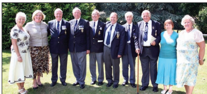
HMS Hermes Association members