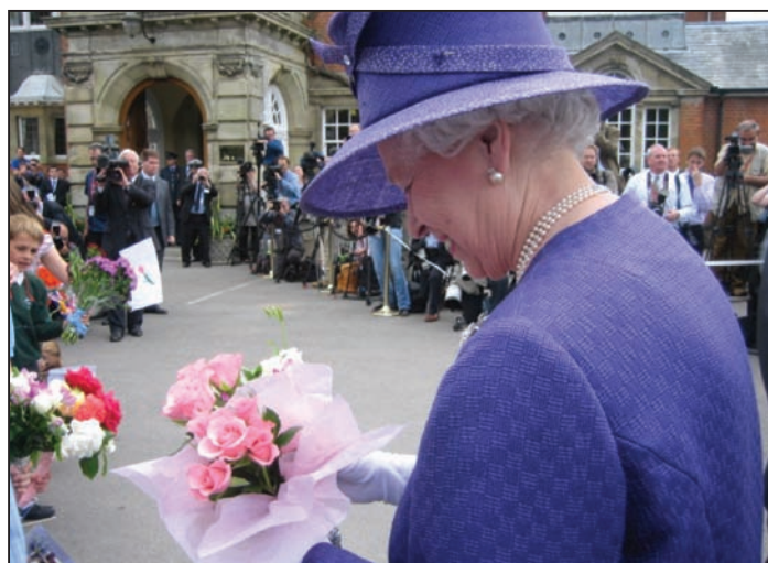
Her Majesty The Queen enjoys the children & their posies on 14th June 2007