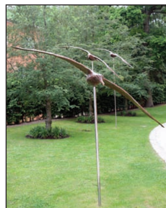
Mark Coreth's bronze albatrosses beside the Chapel