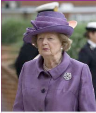
Baroness Thatcher at the Chapel in 2007