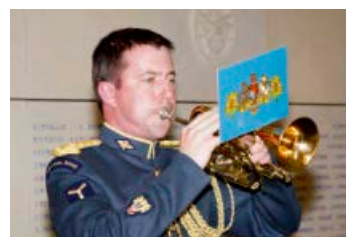
The Bugler of the Central Band of the RAF